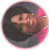
Lotus Douglas South Central Region